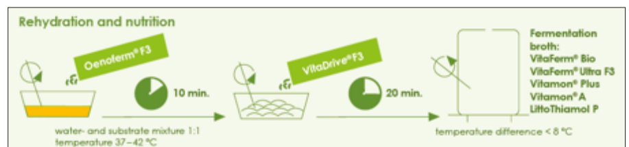
Rehydration and nutrition

In the following years the Scandinavian breweries also turned their attention to cider and reinterpreted cider without having a domestic history of cider making. This resulted in the second cider wave – sweet, refreshing, often flavored beverages, which no longer have anything in common with the original style. Cider is still, however, based on fermented apple juice.